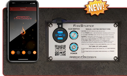
FyreStarter Bluetooth Control