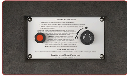
Manual Flame Sensing Control System