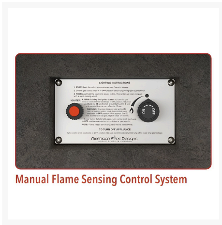
Manual Flame Sensing Control System