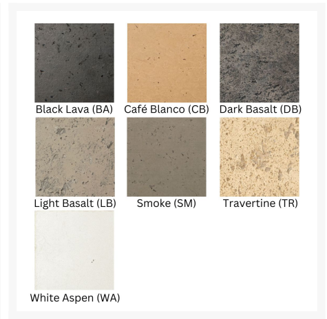
Black Lava (BA) Café Blanco (CB) Dark Basalt (DB) Light Basalt (LB) Smoke (SM) Travertine (TR) White Aspen (WA)