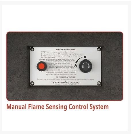
Manual Flame Sensing Control System