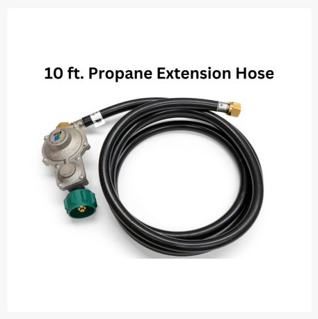
10 ft. Propane Extension Hose