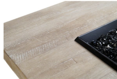
Silver Pine (SP)