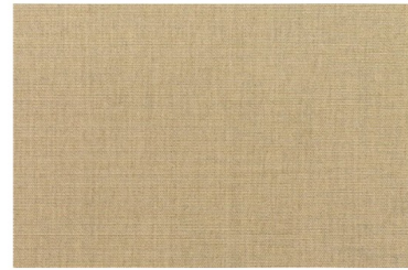
Canvas Heather Beige