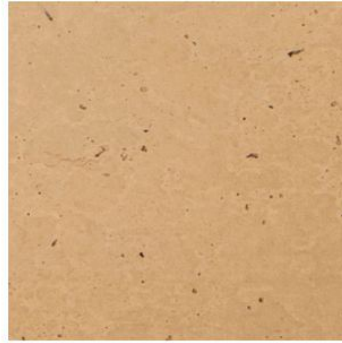
Café Blanco (CB)