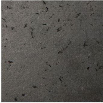
Black Lava (BA)