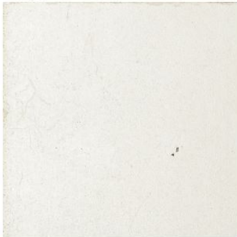
White Aspen (WA)