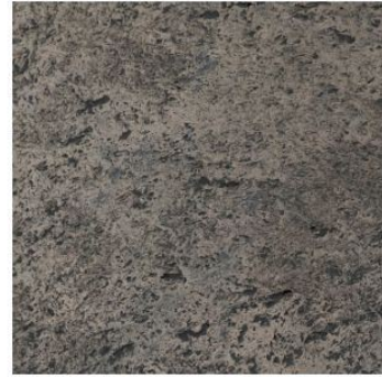
Dark Basalt (DB)