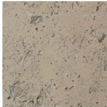
Light Basalt (LB)