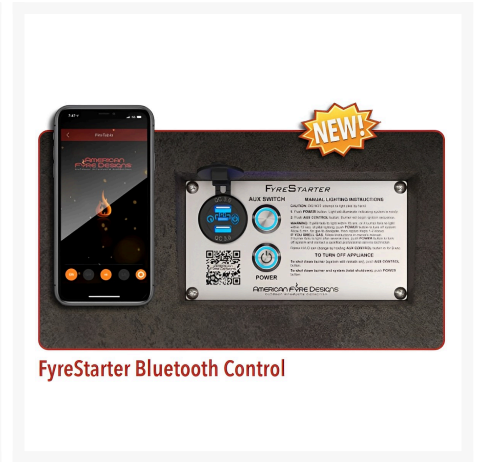
FireStarter Bluetooth Control