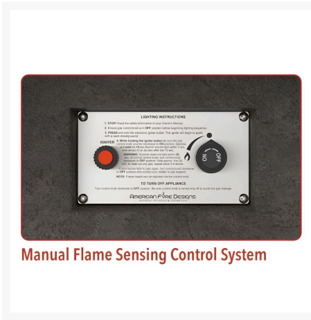
Manual Flame Sensing Control System