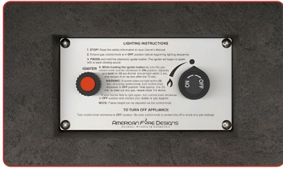
Manual Flame Sensing Control System