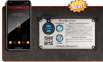
FyreStarter Bluetooth Control