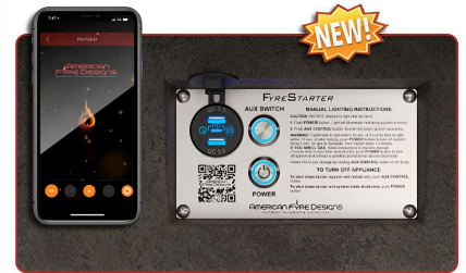
FyreStarter Bluetooth Control