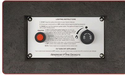
Manual Flame Sensing Control System