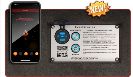
FireStarter Bluetooth Control