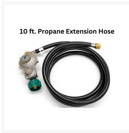
10 ft. Propane Extension Hose