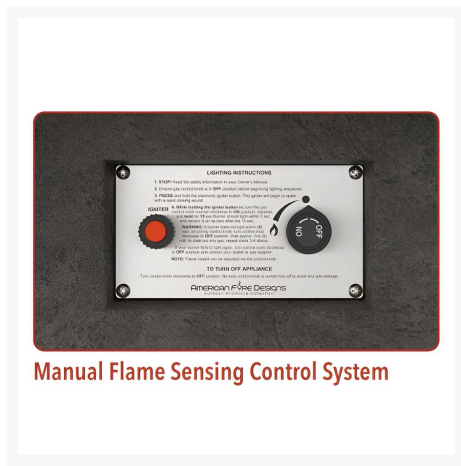
Manual Flame Sensing Control System