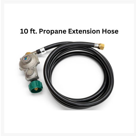
10 ft. Propane Extension Hose