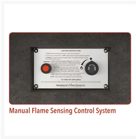
Manual Flame Sensing Control System