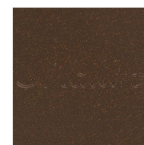
Chestnut Brown / Auburn Brown (48)