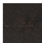
Autumn Rust (99)