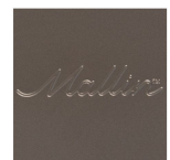
Glimmer Gray (24)