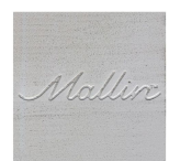
Weathered White / Distressed White (70)