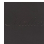
Satin Black (M7)