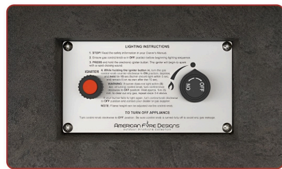
Manual Flame Sensing Control System