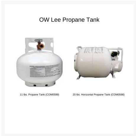
OW Lee Propane Tank