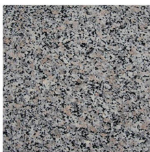
Bright Granite (BGT)