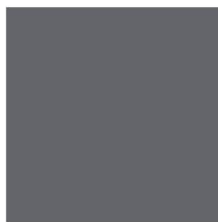
Bright Gray (BGY)