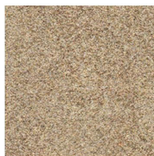
Bright Sandstone (BSN)