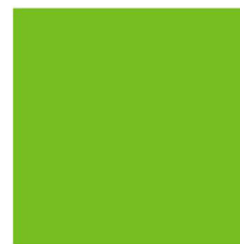
Bright Green (BGN)