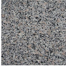
Bright Granite (BGT)