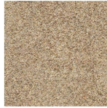
Bright Sandstone (BSN)