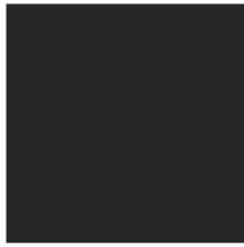
Bright Black (BBK)