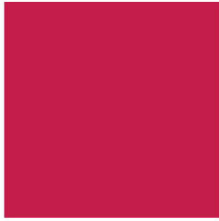
Bright Red (BRD)