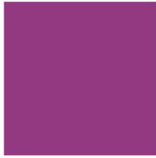
Bright Fuchsia (BFS)