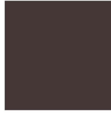
Bright Brown (BBR)