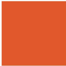
Bright Orange (BNG)