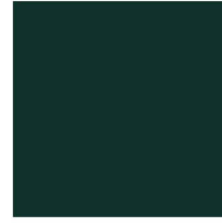
Bright Forest (BFG)