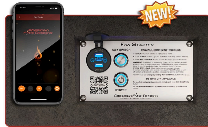
FyreStarter Bluetooth Control