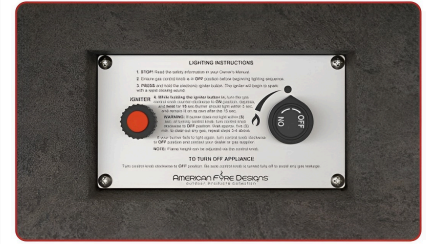
Manual Flame Sensing Control System