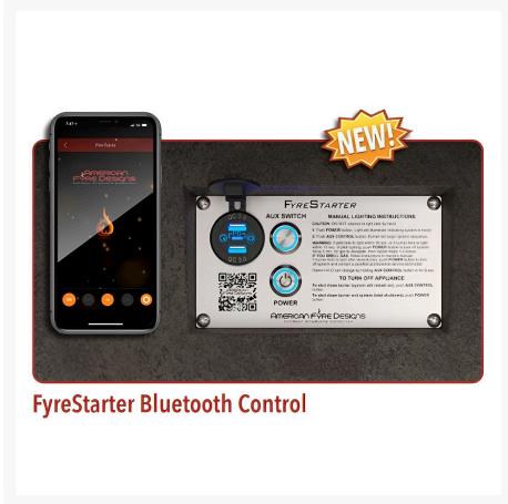
FyreStarter Bluetooth Control