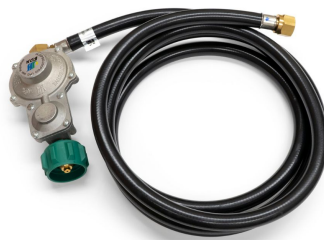
10 ft. Propane Extension Hose