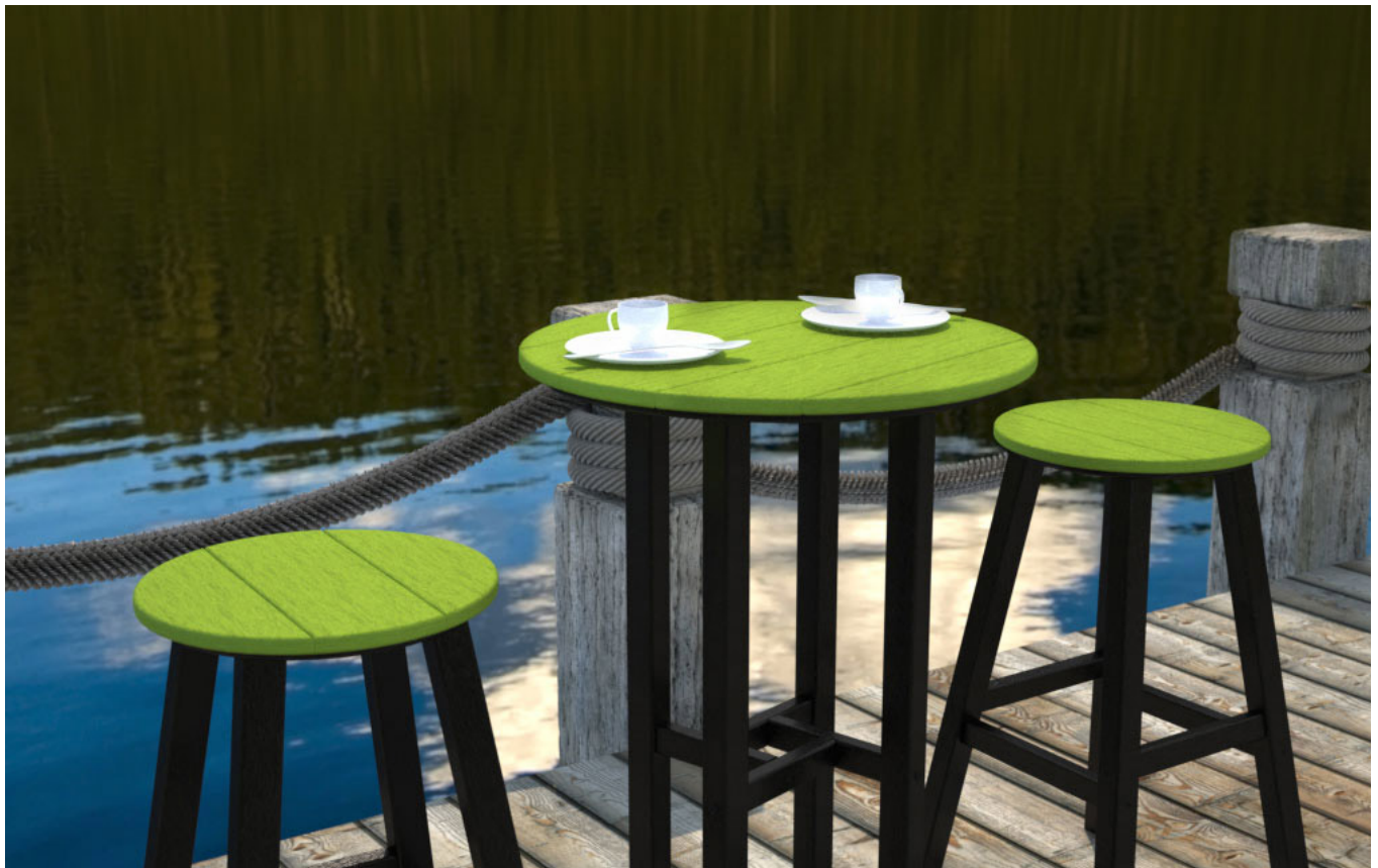
BAR124 - Dual-Color Counter Ht Stool [14 lbs]