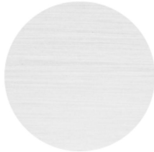
Whitewash – Aluminum