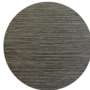
Ash Grey – Aluminum