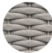
Beige - Durastrap