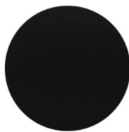
Graphite - Aluminum