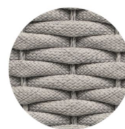
Beige - Durastrap