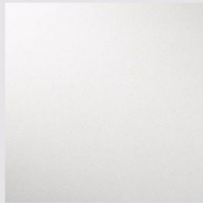
Ice White Tabletop