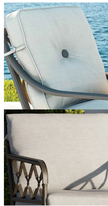
Tufted Cushion (With Button & Welt)