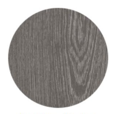
Pearl Grey - Aluminum