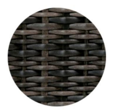
Wild Truffle - Resin