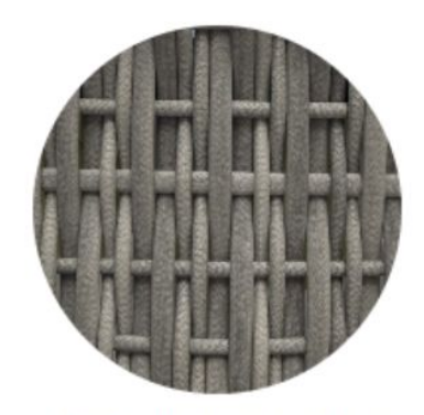
Creamy Mushroom - Resin