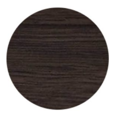
Hessonite Garnet - Aluminum