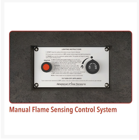
Manual Flame Sensing Control System