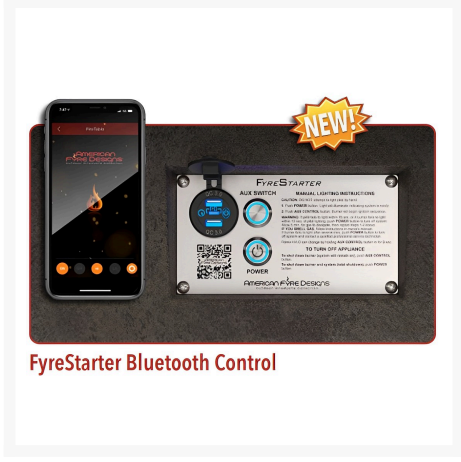
FyreStarter Bluetooth Control