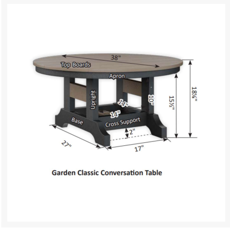
Garden Classic Conversation Table