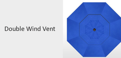
Double Wind Vent