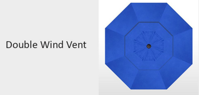
Double Wind Vent