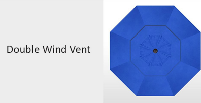
Double Wind Vent