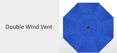
Double Wind Vent