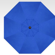
Single Wind Vent