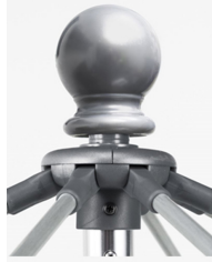
Classic Ball Finial (BF POLYMER)

Note: Finial will match chosen frame finish