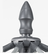
Vertex Finial (VF POLYMER)