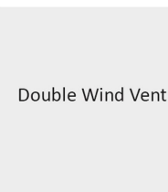
Double Wind Vent