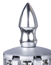
Vertex Finial (VF CHROME)