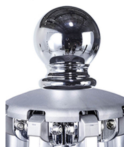
Classic Ball Finial (BF CHROME)

Onyx (BK) Desert Bronze (BZ) Heather Willow (HW) Brushed Silver (MS) Platinum (SR) Golden Oak (WG) Alpine White (WW) Carbon (CB)