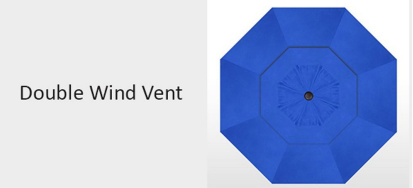
Double Wind Vent