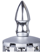
Vertex Finial (VF CHROME)