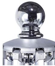
Classic Ball Finial (BF CHROME)