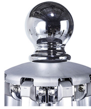
Classic Ball Finial (BF CHROME)

Onyx (BK) Desert Bronze (BZ) Heather Willow (HW) Brushed Silver (MS) Platinum (SR) Golden Oak (WG) Alpine White (WH) Carbon (CB)