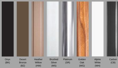
Onyx (BK) Desert Bronze (BZ) Heather Willow (HW) Brushed Silver (MS) Platinum (SR) Golden Oak (WG) Alpine White (WH) Carbon (CB)