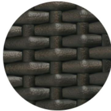
Leather Antique Brown – Resin