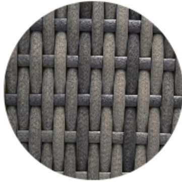
Oyster Grey – Resin