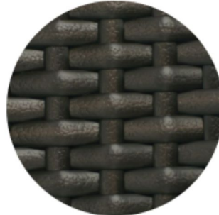
Leather Antique Brown – Resin