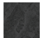
70 - CHAR