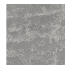
21 - DRIFT