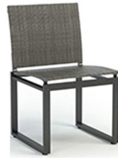
Sling without Welt