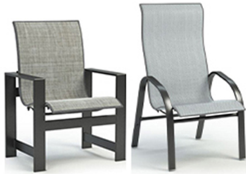
Sling with Welt