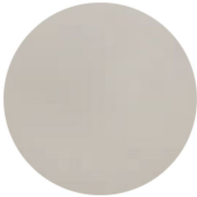
Pearl – Aluminum