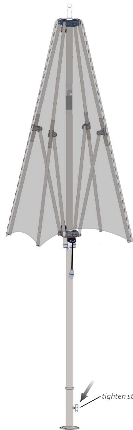
a with above ground base