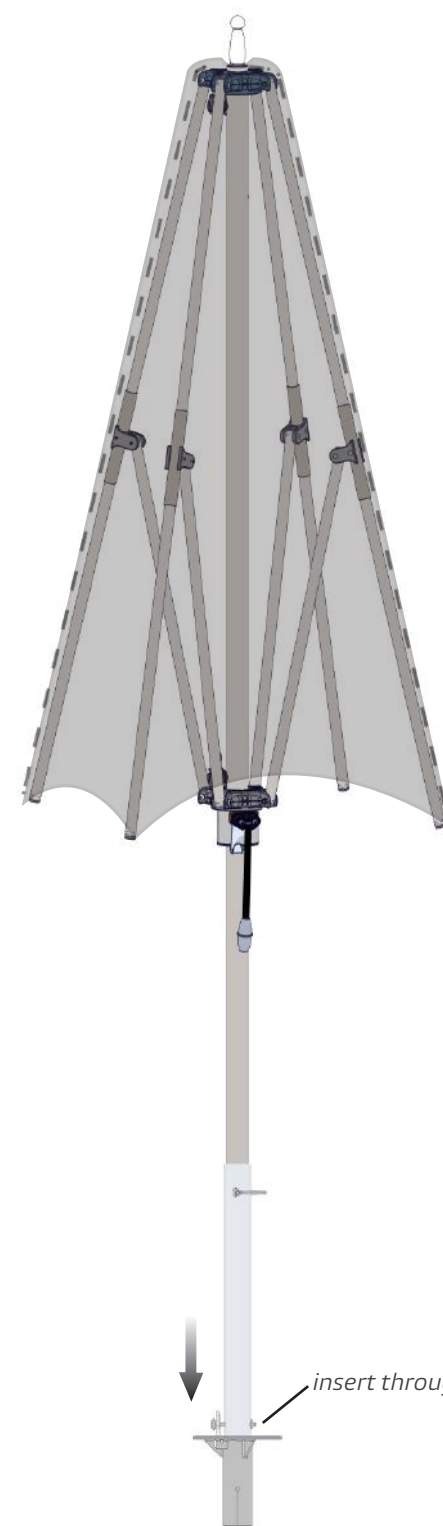
b with in-ground flush mount