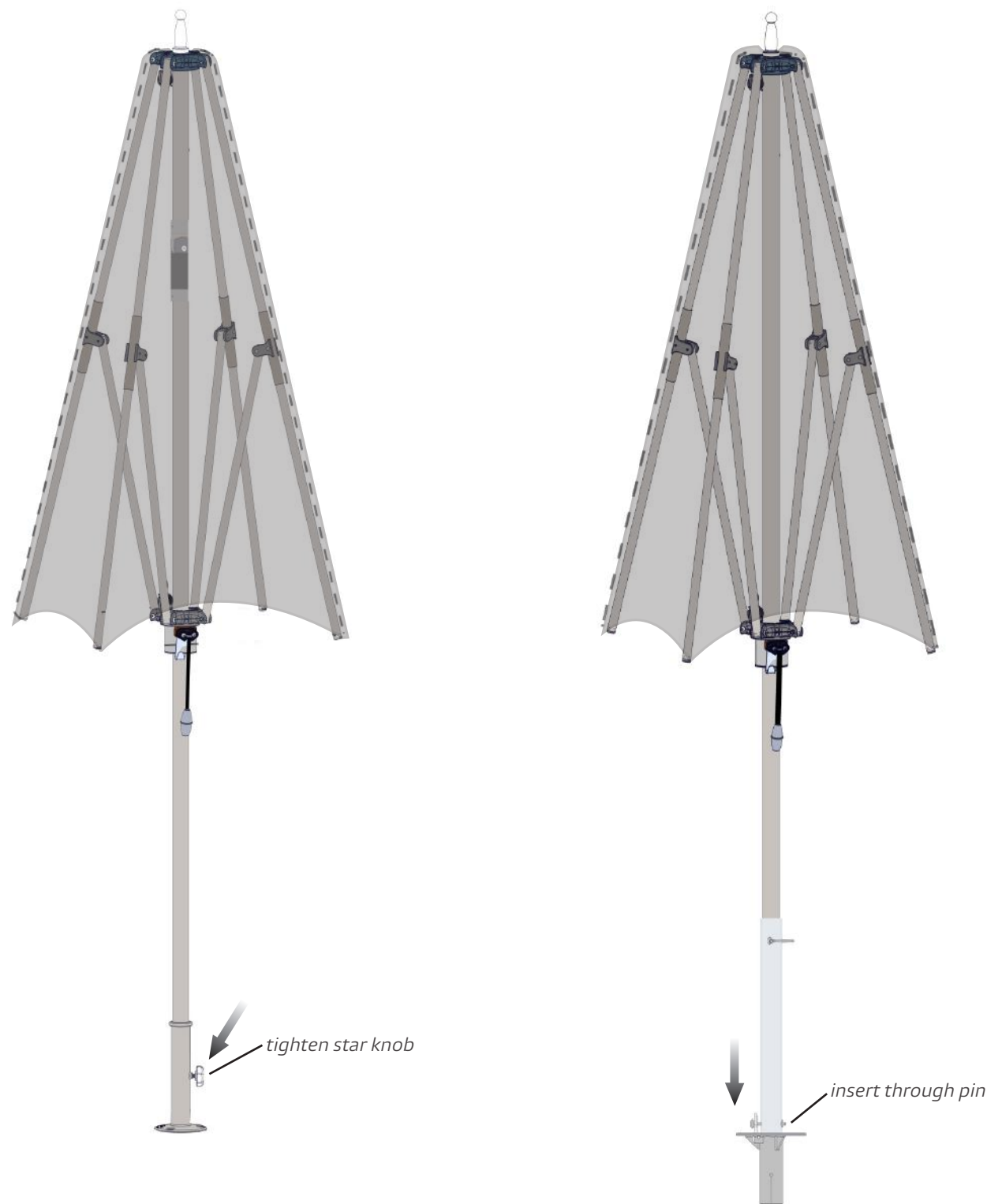
a with above ground base