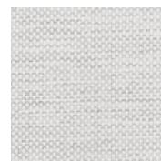
SALT SA SOLUTION-DYED OLEFIN

Quick Ship upholstery shown above. Optional lumbar pillow (1LP-02SA) sold separately, and available in the Quick Ship fabric shown above.