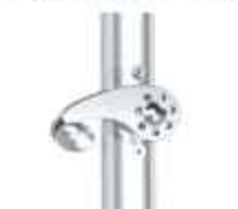
Easy Drive Crank Lift System