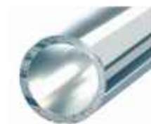
Armor Wall Mast (Optional 1.5" or 2.0" mast)