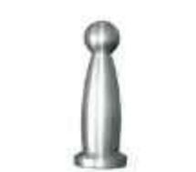
Venico Aluminum Finial