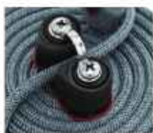
Auto-LOC Marine Pulley Lift System