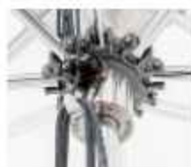
Patented Independent Bracket Hub System