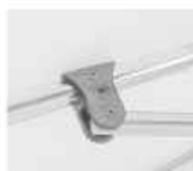
Reinforced Strut Joint Connector