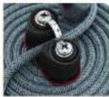
Auto-LOC Marine Pulley Lift System