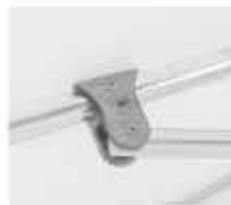
Reinforced Strut Joint Connector