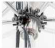
Patented Independent Bracket Hub System