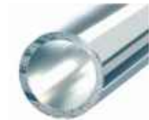
Armor Wall Mast (Optional 1.5" or 2.0" mast)