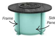
4. PICK A FIRE TABLE BASE COLOR (ex. Carbon)