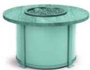
1. PICK A FIRE TABLE COLLECTION (ex. Timber | Valero Base)

Homecrest has made selecting top colors and frame finishes for your fire table easy! Simply follow the steps below to create a look that suits you. To help you visualize and customize your fire table, use our Interactive Design Center at design.homecrest.com .