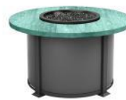
5. SELECT A FIRE TABLE TOP COLOR (ex. Char)