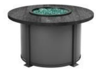
6. CHOOSE YOUR REFLECTIVE FIRE JEWELRY AND OPTIONAL ACCESSORIES (ex. Platinum)

Note: Duo-Tone option is available for Mode fire pits (select a base color and a top color).