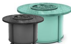
2. SELECT A FIRE TABLE HEIGHT (ex. Chat)