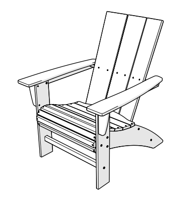
AD620 Modern Curveback Adirondack Chair polywoodoutdoor.com