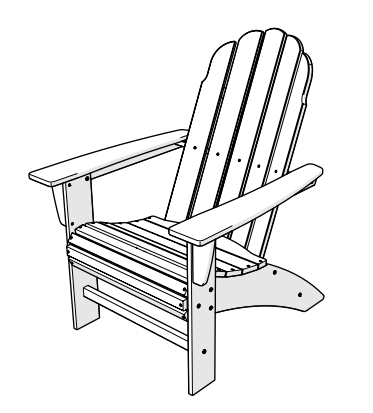
AD600 Vineyard Curveback Adirondack Chair