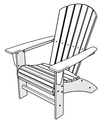
AD610 Nautical Curveback Adirondack Chair