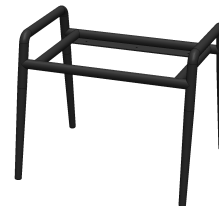
TABLE BASE (406F)