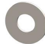
1/4 - 20 FLAT WASHER