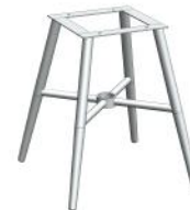
TABLE BASE (405F)